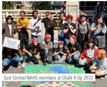
East Central NAHS members at Chalk It Up 2022