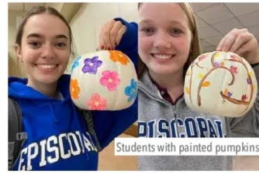
Students with painted pumpkins