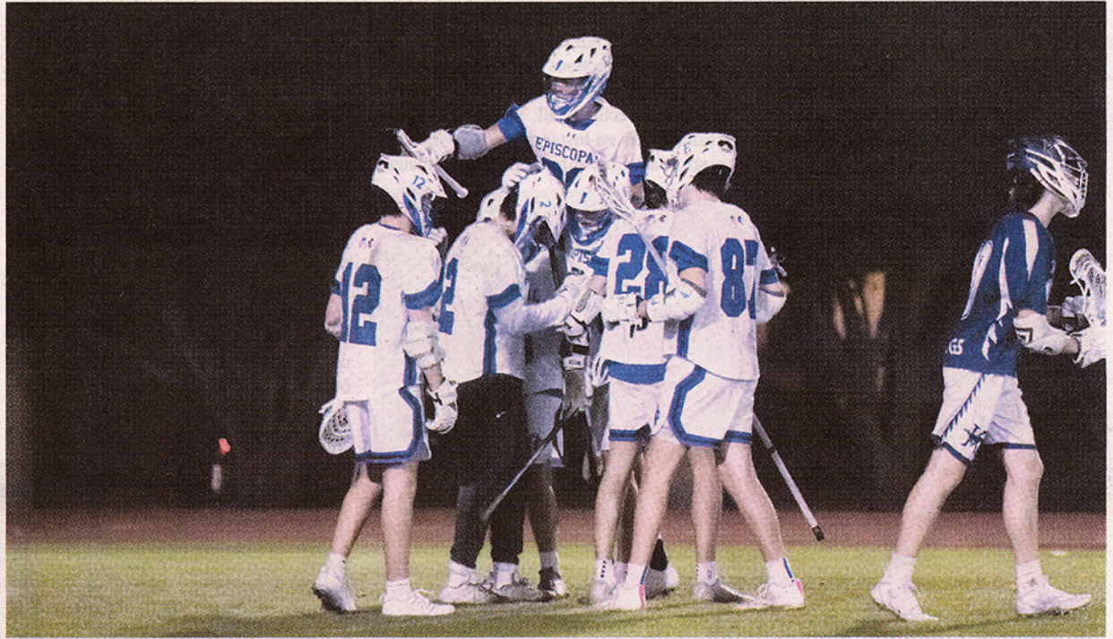
The varsity boys lacrosse team celebrates a victory against Second Baptist School and are excited about what lies ahead for the program.

Teamwork and dedication have been the focus during unforgettable year